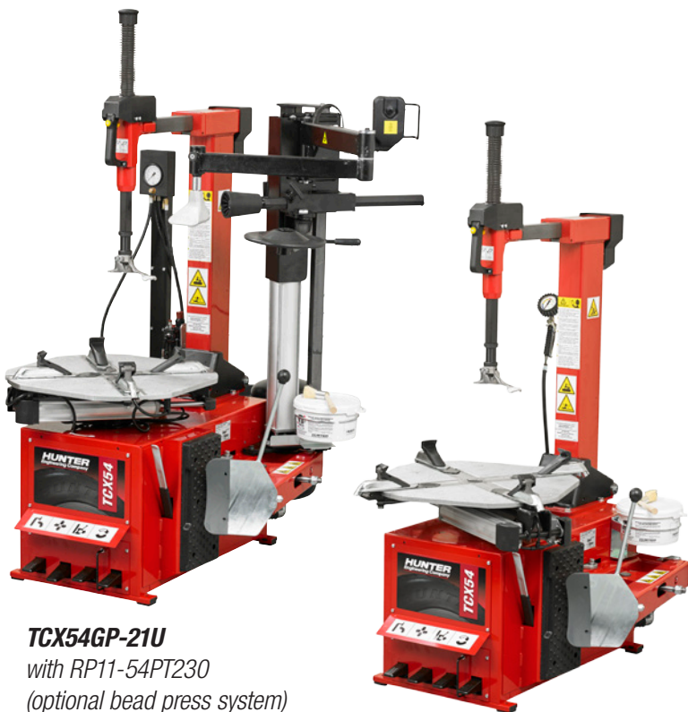
TCX54GP-21U with RP11-54PT230 (optional bead press system)

Some dimensions, capacities and specifications may vary depending on tire and wheel configurations.